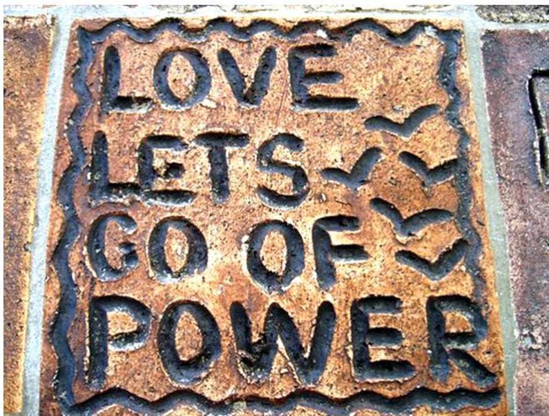
Tile from Peace Wall in Hamilton, New Zealand

We at St. Elisabeth's share an adventurous spirit and a commitment to radiate God's love within and beyond our red doors.