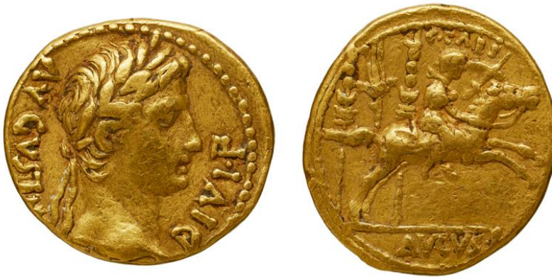
Roman Coin of Caesar Augustus: 1st century In the Bibliothèque nationale, Paris, France

Welcome to Saint Elisabeth's. We are delighted to have you with us today.