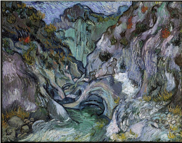
Ravine by Vincent van Gogh

Welcome to Saint Elisabeth's. We are delighted to have you with us this today.