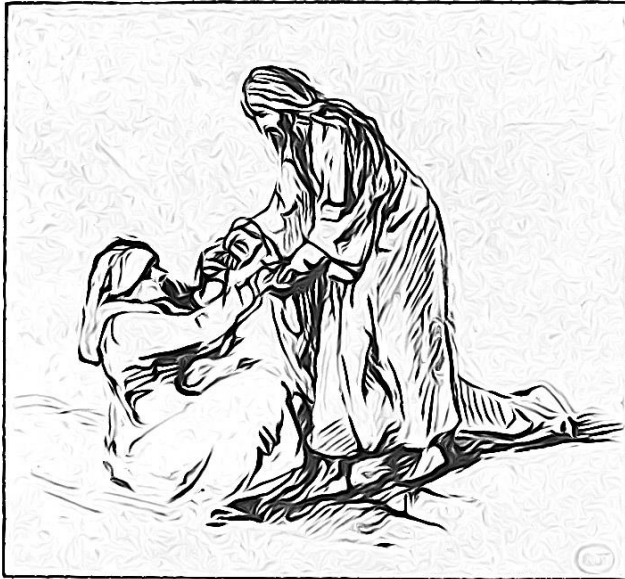
Jesus Healing Peter's Mother-in-Law Rembrandt Harmenszoon van Rijn, 1606-1669

Welcome to Saint Elisabeth's. We are delighted to have you with us today.